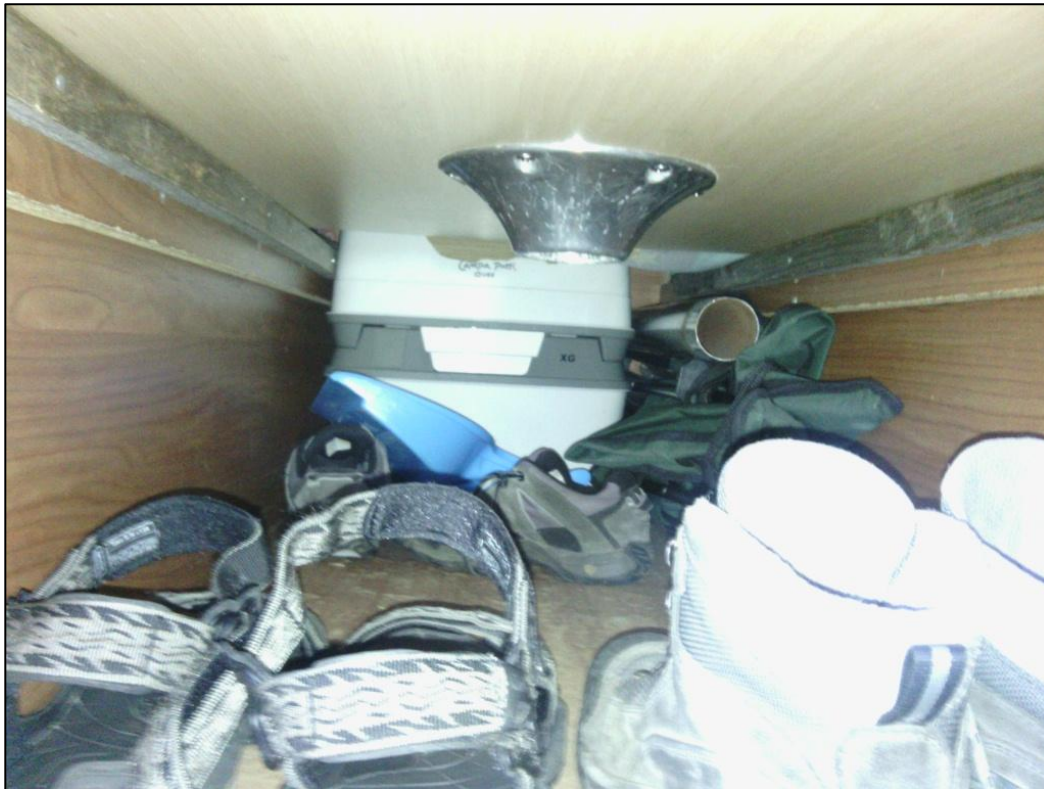
Porter Potty cassette toilet under a bed in a small Lite Ace van.

In addition to this problem with "certified" vehicles another small backpacker type van was located recently at the Whangapoua designated site for certified self-contained vehicles with a genuine looking certification sticker on the rear. When questioned by the officer about the certification documentation the occupant (from Belgium) admitted that he didn't have any documents and no toilet. He then admitted buying the sticker. The officer peeled the sticker off the vehicle, ripped it apart, handed it to the occupant along with a $200 infringement and gave him 10 minutes to depart the area.