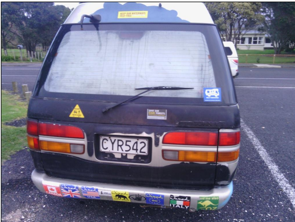
Certified Lite Ace van showing self-contained sticker on rear.