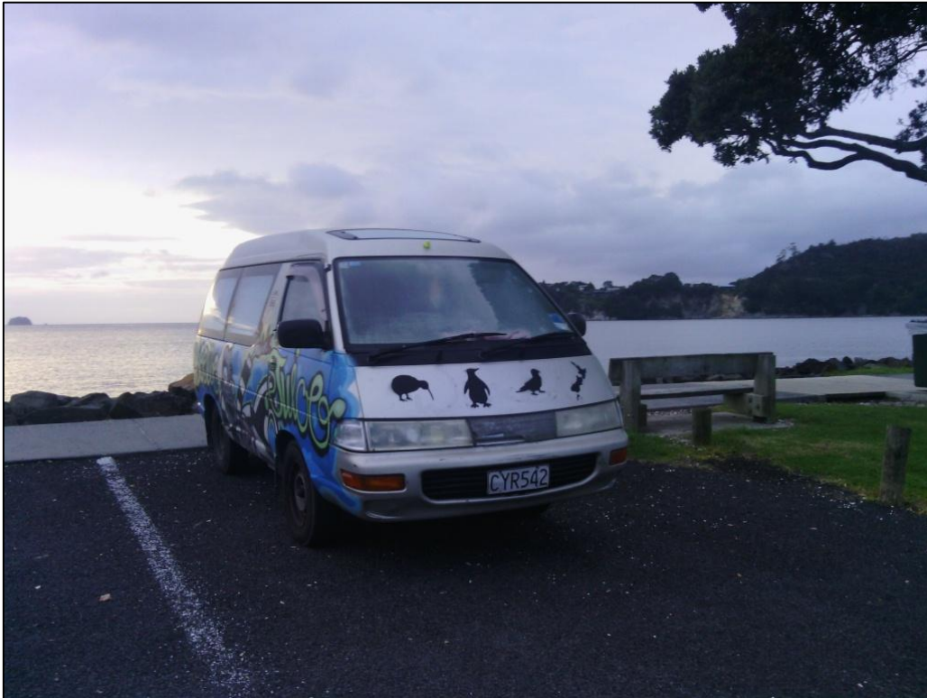
Certified self-contained lite ace van parked up at the Buffalo Beach Designated site.

the vehicles on from the designated areas.