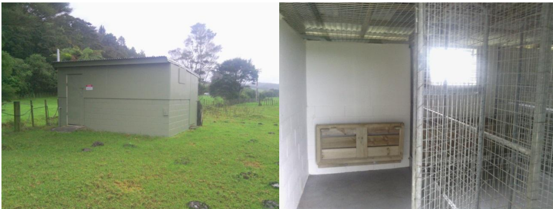
Whitianga Dog Pound - showing exterior & refurbished kennels with fold down bedding

The Whitianga dog Pound was upgraded in February 2016 after a brief closure due to security and sanitation issues at this very old facility. The upgrade included lining and painting the interior, painting the exterior and closing in open windows, installing an additional kennel and meshing the ceiling of all kennels. Shelves were also installed to ensure all feed / water bowls were off the floor. The Whitianga Pound is a short term stay facility with all dogs with any security risks being moved to the District Pound in Thames. Security at the pound continues to be an issue as it has no fencing and is exposed to the public in a remote location. Security cameras and signage are being installed as an interim measure while budgets are being sought for fencing.