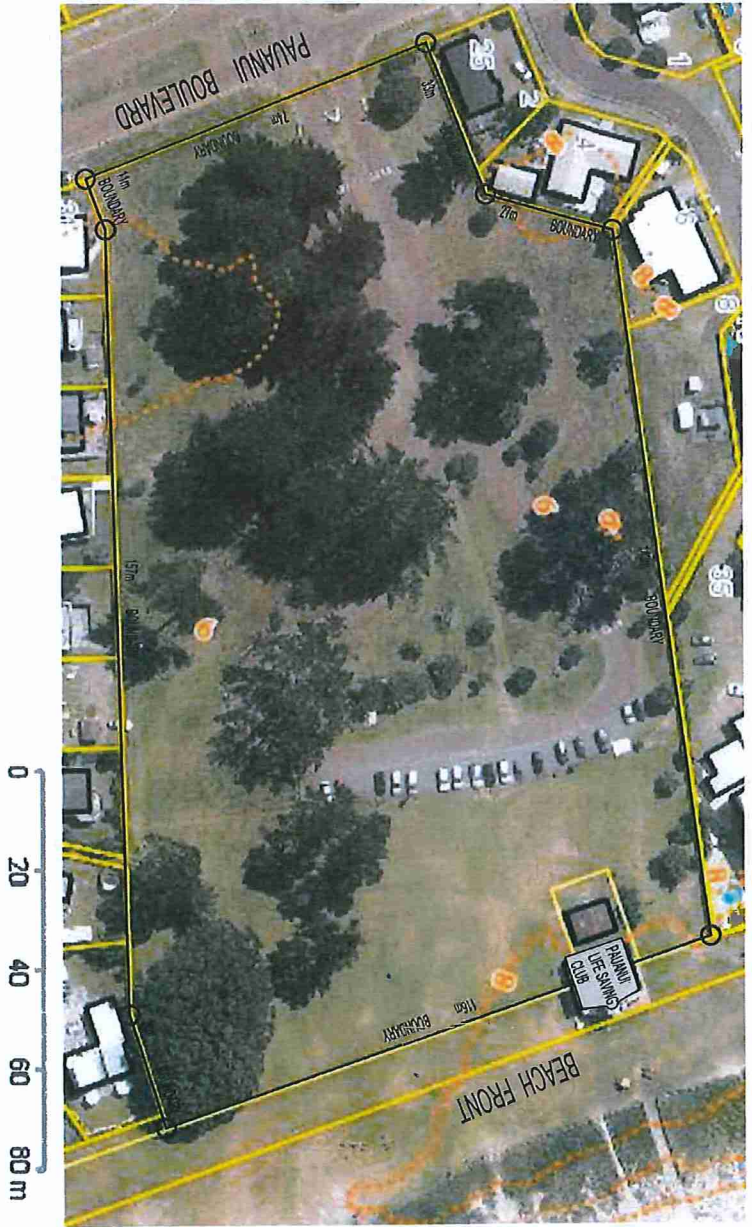
LOCATION PLAN SCALE: 1:300 @ 9" x 11"