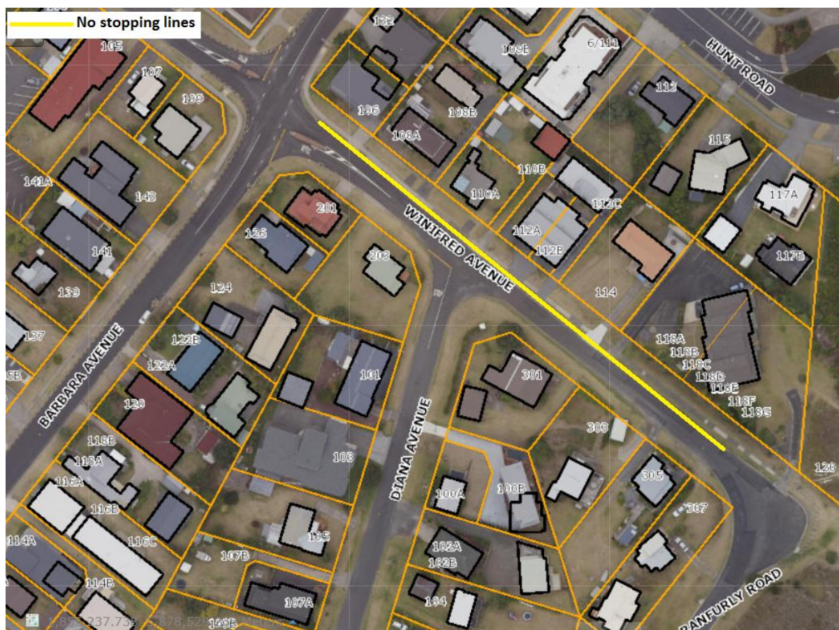
Diagram 1: Winifred Ave No Stopping Lines