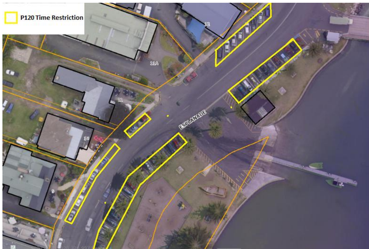
Diagram 1: The Esplanade, Whitianga. 120min Time Restricted Parking