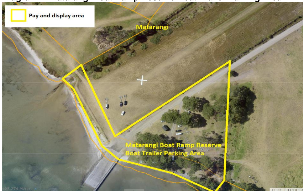
Diagram 1: Matarangi Boat Ramp Reserve Boat Trailer Parking Area